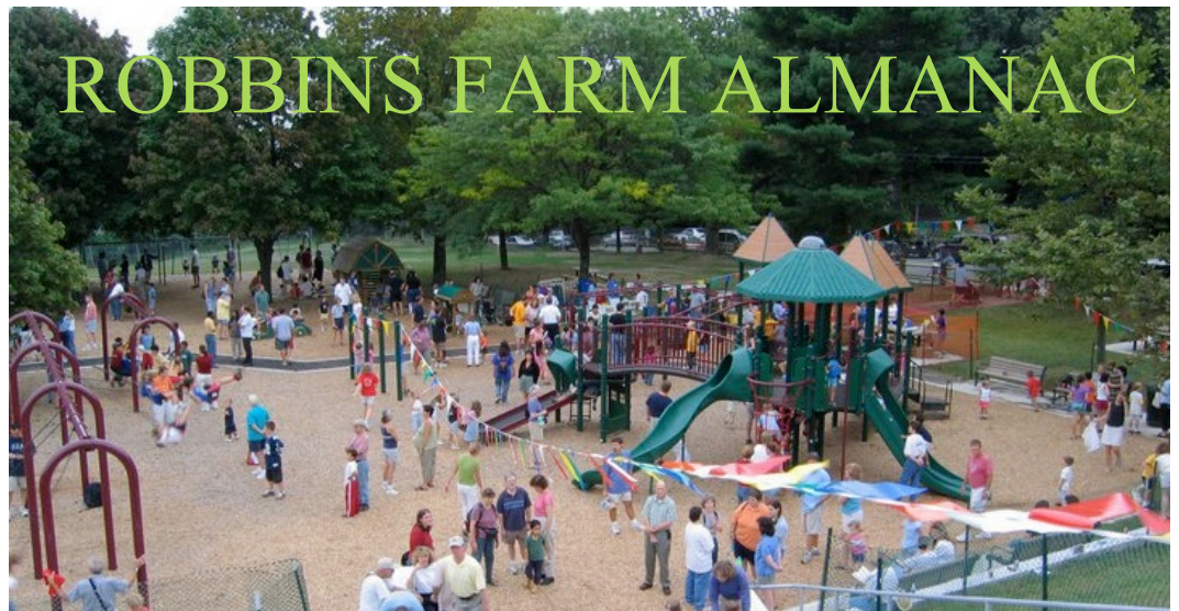
Newsletter of the Friends of Robbins Farm Park